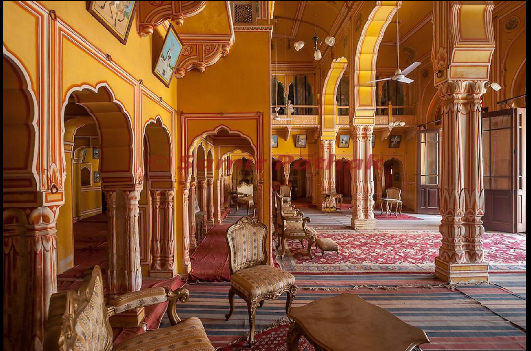
DIWAN- E- KHAS , DUNDLOD FORT