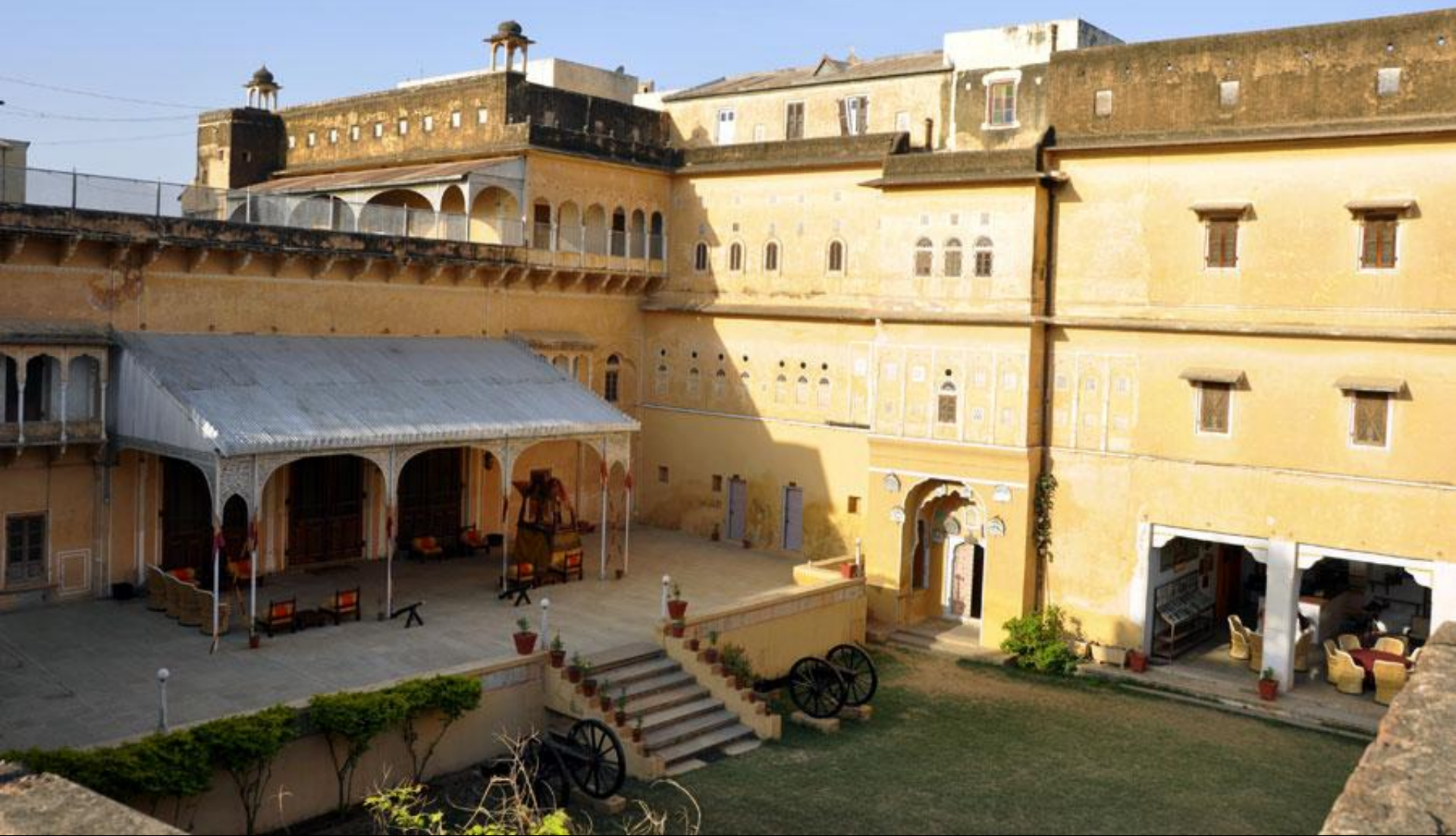
DAY 1 ARRIVAL AT DUNDLOD FORT