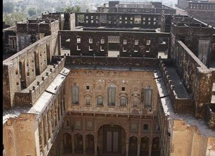
Day 3 Optional Visit to the Merchant haveli known as the Arjundas Goenka Haveli